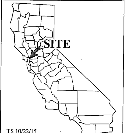
Exhibit B PRC 5782.1 WALTON APN 0062-030-040 GENERAL LEASE - RESIDENTIAL & RECREATIONAL USE SOLANO COUNTY

This Exhibit is solely for purposes of generally defining the lease premises, is based on unverified information provided by the Lessee or other parties and is not intended to be, nor shall it be construed as, a waiver or limitation of any State interest in the subject or any other property.