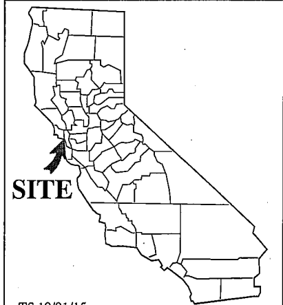
Exhibit B W 26915 MOY APN 023-013-08 GENERAL LEASE - RECREATIONAL USE MARIN COUNTY

This Exhibit is solely for purposes of generally defining the lease premises, is based on unverified information provided by the Lessee or other parties and is not intended to be, nor shall it be construed as, a waiver or limitation of any State interest in the subject or any other property.