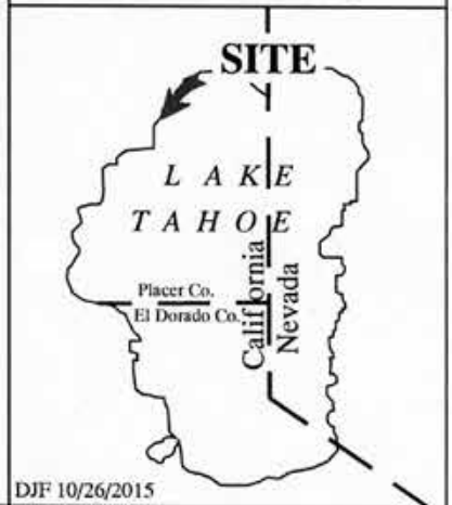
Exhibit B PRC 3879.1 525 HOWARD, LLC APN 092-200-006 GENERAL LEASE - RECREATIONAL USE PLACER COUNTY