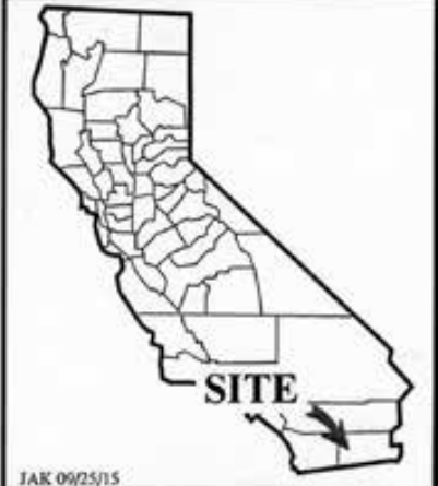
Exhibit A PRC 6405.2 SAN DIEGO GAS & ELEC. APN 033-240-016 GENERAL LEASE - RIGHT-OF-WAY USE IMPERIAL COUNTY

This Exhibit is solely for purposes of generally defining the lease premises, is based on unverified information provided by the Lessee or other parties and is not intended to be, nor shall it be construed as, a waiver or limitation of any State interest in the subject or any other property.