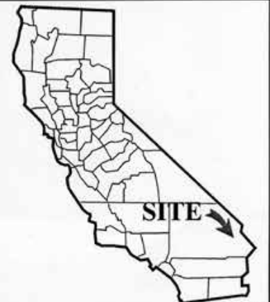
Exhibit A PRC 7509.2 KERN RIVER GAS TRANSMISSION CO. GENERAL LEASE - RIGHT-OF-WAY USE SAN BERNARDINO COUNTY

This Exhibit is solely for purposes of generally defining the lease premises, is based on unverified information provided by the Lessee or other parties and is not intended to be, nor shall it be construed as, a waiver or limitation of any State interest in the subject or any other property.