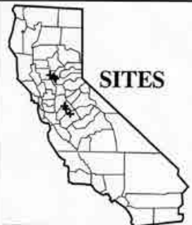
Exhibit B W26508 CVIN FIBER OPTIC PROJECT GENERAL LEASE - RIGHT - OF - WAY USE

This Exhibit is solely for purposes of generally defining the lease premises, is based on unverified information provided by the Lessee or other parties and is not intended to be, nor shall it be construed as, a waiver or limitation of any State interest in the subject or any other property.