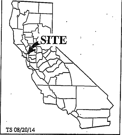
Exhibit B PRC 9158.9 SONOMA LAND TRUST APNs: 068-140-007, 008 & 068-160-007 GENERAL LEASE - OTHER SONOMA COUNTY