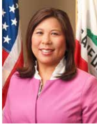
BETTY T. YEE State Controller