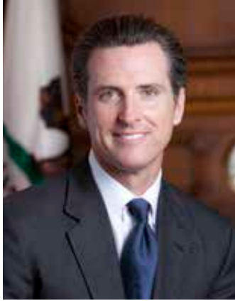
GAVIN NEWSOM Lieutenant Governor