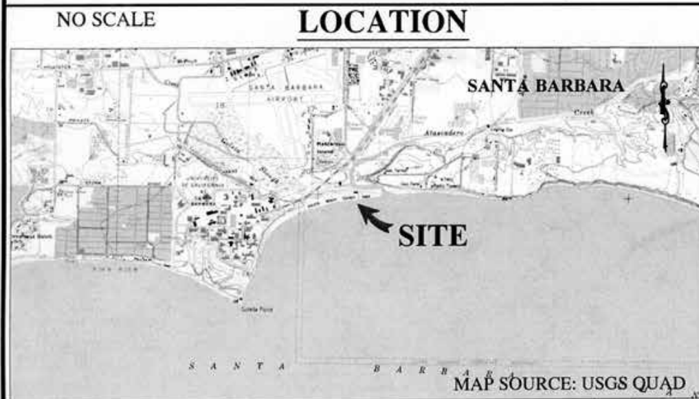
Exhibit B PRC 1431.9 COUNTY OF SANTA BARBARA GENERAL LEASE - PUBLIC AGENCY USE SANTA BARBARA CO.