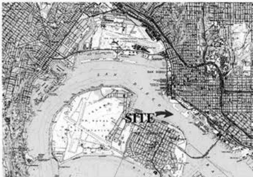
Exhibit A PRC 5392.1 SAN DIEGO GAS & ELECTRIC COMPANY GENERAL LEASE - RIGHT-OF-WAY USE SAN DIEGO COUNTY