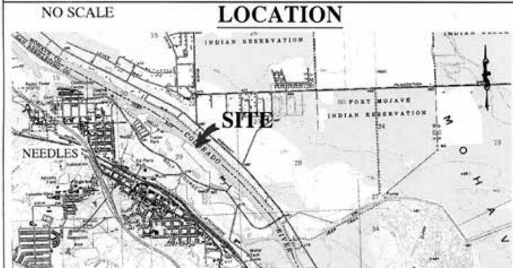
Exhibit B PRC 9086.1 DENTON APN 0186-273-18 GENERAL LEASE - RECREATIONAL AND PROTECTIVE STRUCTURE USE SAN BERNARDINO COUNTY