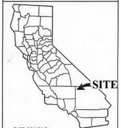
Exhibit B PRC 1531.2 PACIFIC GAS & ELECTRIC APN 0483-181-27 GENERAL LEASE - RIGHT-OF-WAY USE SAN BERNARDINO COUNTY

This Exhibit is solely for purposes of generally defining the lease premises, is based on unverified information provided by the Lessee or other parties and is not intended to be, nor shall it be construed as, a waiver or limitation of any State interest in the subject or any other property.