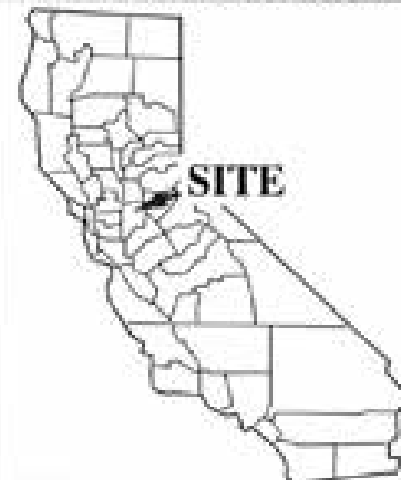
Exhibit A PRC 8044.1 TIME WARNER TELECOM CALIFORNIA LP GENERAL LEASE - RIGHT-OF-WAY USE SACRAMENTO, SAN JOAQUIN & STANISLAUS COUNTIES

This Exhibit is solely for purposes of generally defining the lease premises, is based on unverified information provided by the Lessee or other parties and is not intended to be, nor shall it be construed as, a waiver or limitation of any State interest in the subject or any other property.