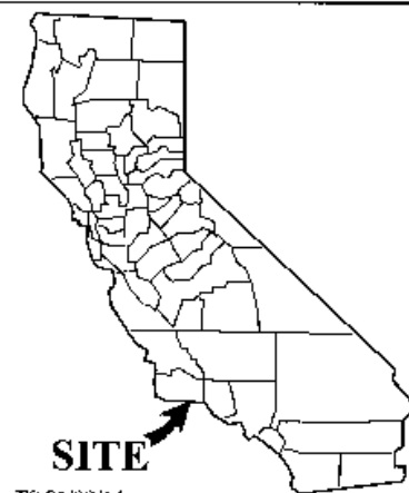
Exhibit B PRC 3204.9 GOLETA SANITARY DISTRICT GENERAL LEASE - PUBLIC AGENCY USE SANTA BARBARA COUNTY

This Exhibit is solely for purposes of generally defining the lease premises, is based on unverified information provided by the Lessee or other parties and is not intended to be, nor shall it be construed as, a waiver or limitation of any State interest in the subject or any other property.