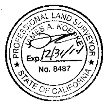
Page 1 of 2

Prepared 01/28/2014 by the California State Lands Commission Boundary Unit.