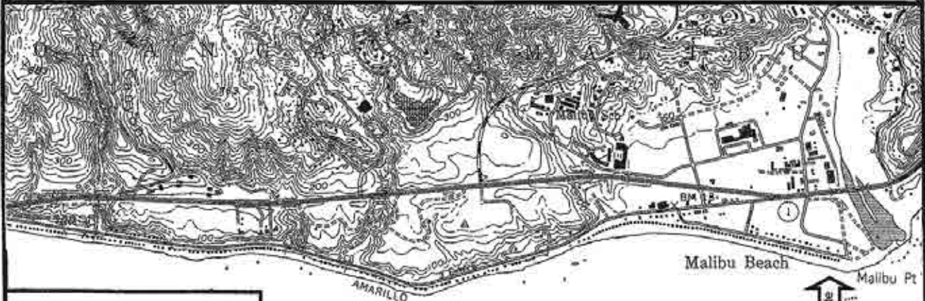
Exhibit A W24665 23354 Malibu Colony Drive