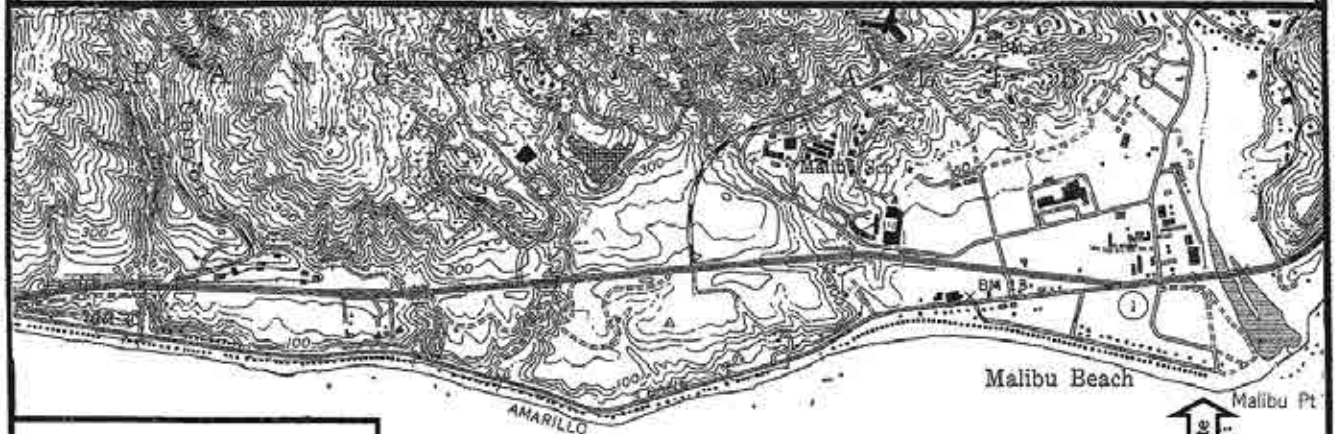
Exhibit A W24665 23316 Malibu Colony Drive