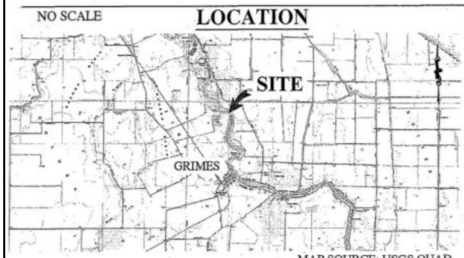
Exhibit B FOOTHILL ENERGY OIL & GAS LEASE COLUSA & SUTTER COUNTIES