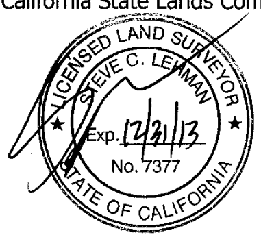
Page 2 of 2

Prepared 06/29/12 by the California State Lands Commission Boundary Unit