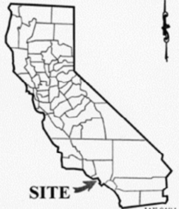
Exhibit A PRC 8754.1 GENERAL LEASE NON-COMMERCIAL USE PACIFIC OCEAN LOS ANGELES COUNTY

SITE SANTA MONICA 200 METER DIA. CIRCULAR PARCEL