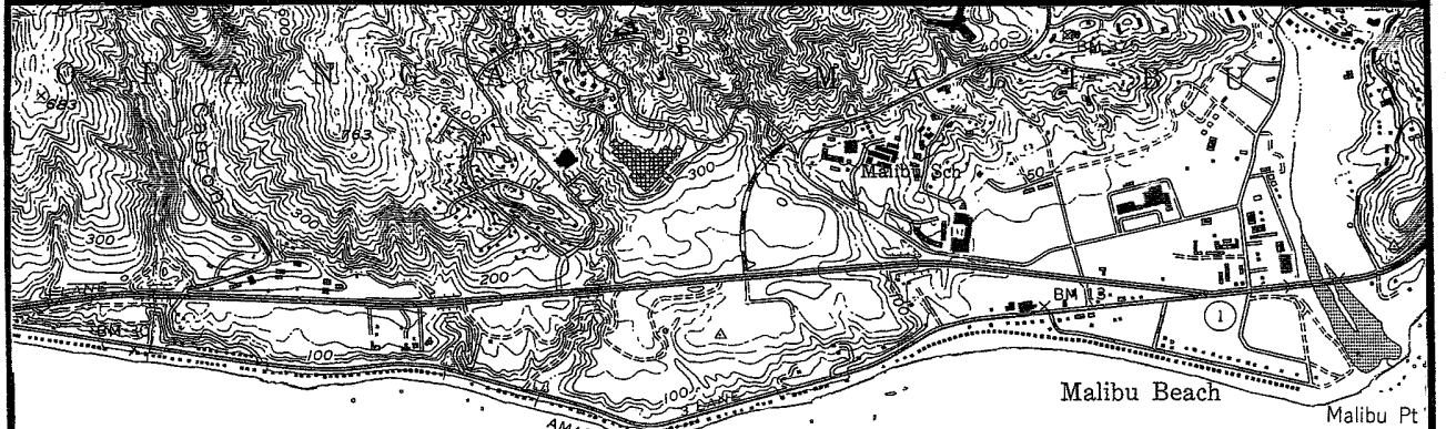
Exhibit A W24665 24420 Malibu Road