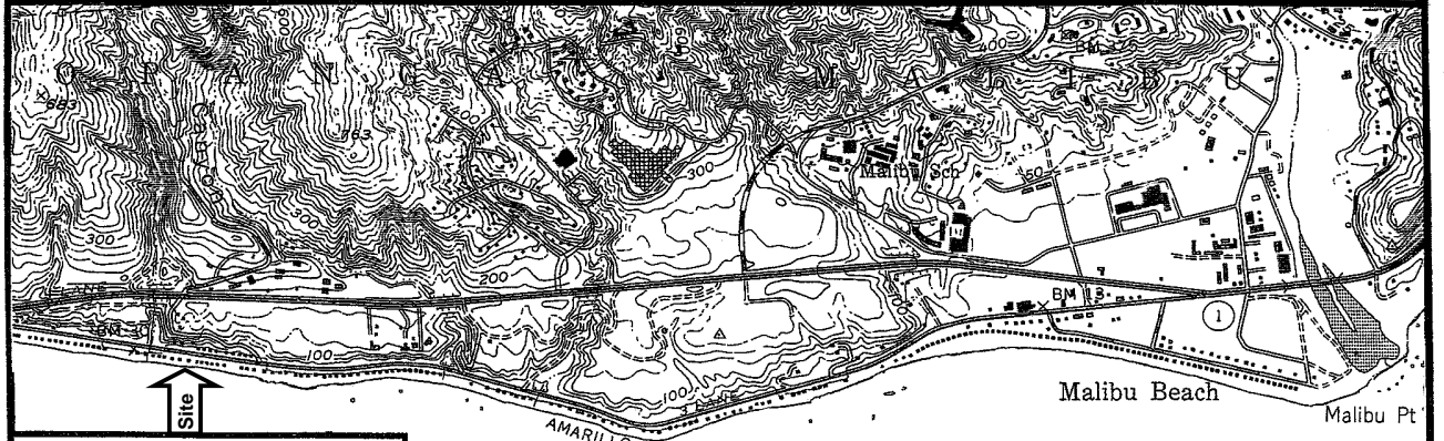
Exhibit A W24665 25164 Malibu Road