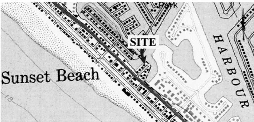
MAP SOURCE: USGS QUAD