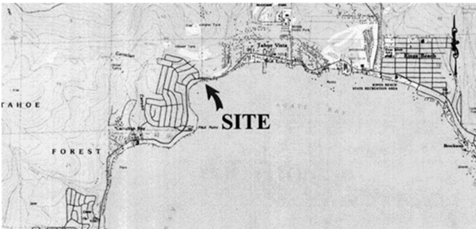
MAP SOURCE: USGS QUAD