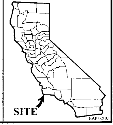
Exhibit A PRC 6942.1 PLAINS EXPLORATION & PRODUCTION COMPANY RIGHT OF WAY LEASE SANTA BARBARA COUNTY

This Exhibit is solely for purposes of generally defining the lease premises, is based on unverified information provided by the Lessee or other parties and is not intended to be, nor shall it be construed as, a waiver or limitation of any State interest in the subject or any other property.