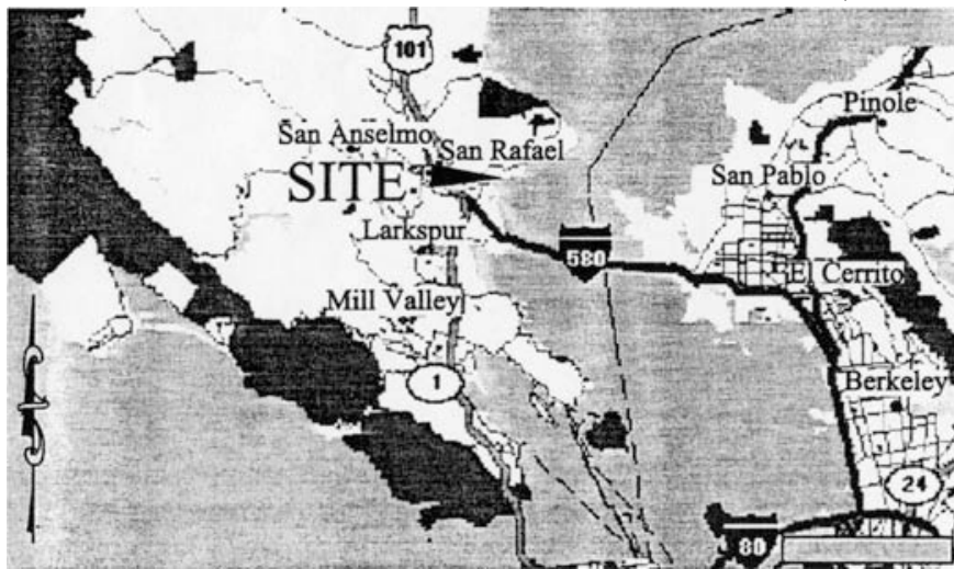
Exhibit A PRC 7160 Lowrie Yacht Harbor Dredging City of San Rafael MARIN COUNTY