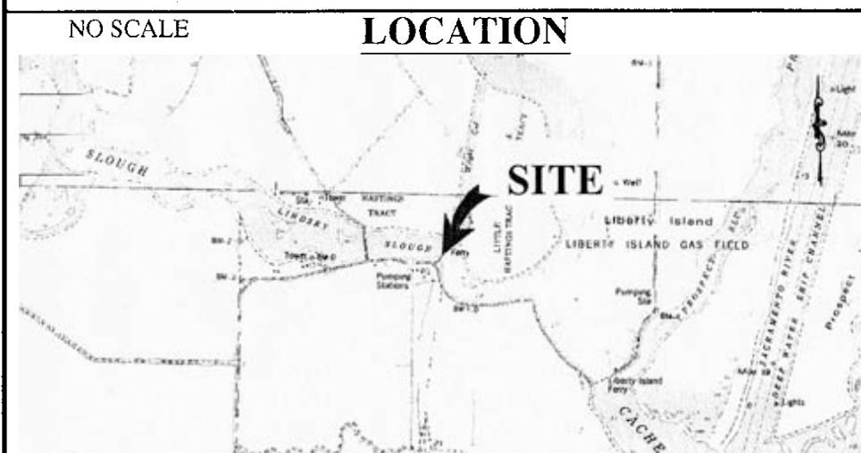
Exhibit A W 26411 UNDERWOOD TRESPASS & EJECTMENT SOLANO COUNTY