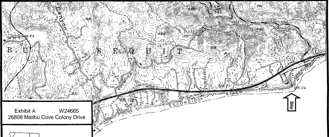
Exhibit A W24665 26808 Malibu Cove Colony Drive