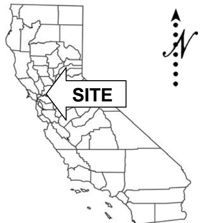
Exhibit A PRC 7757 Suisun City Marina Suisun Slough Solano County

This exhibit is solely for purposes of generally defining the lease premises, is based on unverified information provided by the Lessee or other parties, and is not intended to be, nor shall it be construed as a waiver or limitation of any State interest in the subject or any other property.