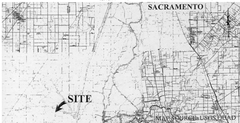
Exhibit A-4 PRC 8679.9 DEPARTMENT OF WATER RESOURCES GENERAL LEASE PUBLIC AGENCY USE SACRAMENTO COUNTY