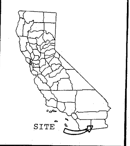
Exhibit A PRC 7428.2 AT&T CORP SCHOOL LANDS GENERAL LEASE IMPERIAL COUNTY

This exhibit is solely for purposes of generally defining the leased premises, is based on unverified information provided by lessee or other parties, and is not intended to be, nor shall it be construed to as a waiver or limitation of any state interest in the subject or any other property.