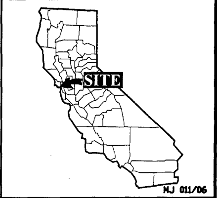
Exhibit A TRANS BAY CABLE LLC PRC 8736 NEW YORK SLOUGH, SUISUN BAY, SAN FRANCISCO BAY & CARQUINEZ STRAIT

This Exhibit is solely for purposes of generally defining the lease premises, is based on unverified information provided by the Lessee or other parties and is not intended to be, nor shall it be construed as, a waiver or limitation of any State interest in the subject or any other property.