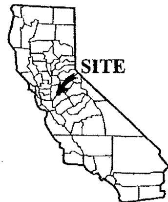
Exhibit A PRC 2057.9 PUBLIC AGENCY USE STATE HWY. 13 STANISLAUS & SAN JOAQUIN COUNTIES