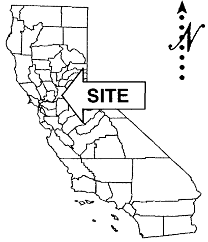
Exhibit A PRC 7203.9 State of California The Reclamation Board

This exhibit is solely for purposes of generally defining the lease premises, is based on unverified information provided by the Lessee or other parties, and is not intended to be, nor shall it be construed as a waiver or limitation of any State interest in the subject or any other property.