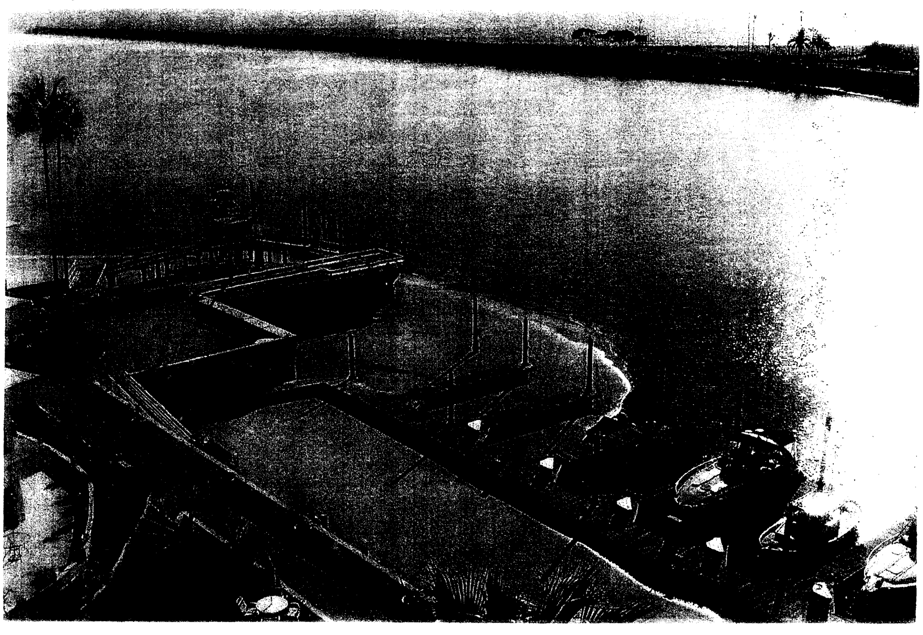
This exhibit is solely for purposes of generally defining the lease premises, and is based on unverified information provided by lessee or other parties, and is not intended to be, nor shall it be construed to, as a waiver or limitation of any state interest in the subject or any other property. GK 07/19/06