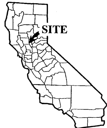
Exhibit A PRC 7913.1 SLAWSON EXPLORATION CO., INC GENERAL LEASE RIGHT OF WAY USE SACRAMENTO RIVER COLUSA & SUTTER CO.

This Exhibit is solely for purposes of generally defining the lease premises, is based on unverified information provided by the Lessee or other parties and is not intended to be, nor shall it be construed as, a waiver or limitation of any State interest in the subject or any other property.