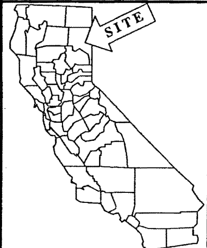
EXHIBIT A PRC 7879.2 Por. APN 81-130-11 School Lands Lassen County

This Exhibit is solely for purposes of generally defining the lease premises, and is not intended to be, nor shall it be construed as, a waiver or limitation of any State interest in the subject or any other property.