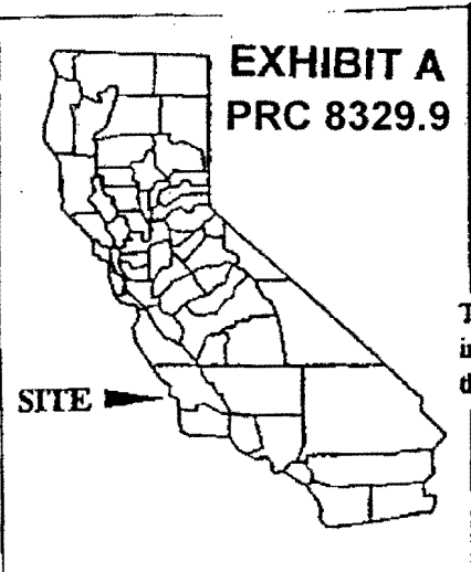
EXHIBIT A PRC 8329.9