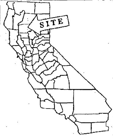
EXHIBIT "A" PRC 6957.9 APN 027 - 270 - 191 Sacramento River TEHAMA COUNTY

This Exhibit is solely for purposes of generally defining the lease premises, and is not intended to be, nor shall it be construed as, a waiver or limitation of any State interest in the subject or any other property.