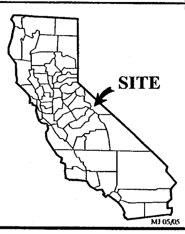
Exhibit A PRC 4645.2 CITY OF LOS ANGELES DEPT. OF WATER & POWER RIGHT OF WAY LEASE SCHOOL LANDS MONO COUNTY