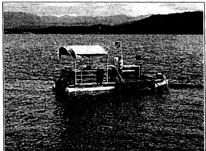
Figure 3. A.C.E. Diving Workboat and Vacuum Assist Equipment at Water Surface on a Lake

This technique immediately clears the water column of nuisance plants and is site and species specific. A high degree of control, lasting more than one season, is possible when complete removal has been achieved. It is most useful in hard-to-reach places and in sensitive areas where disruption of sediments must be minimized. Plant parts are collected for later disposal, minimizing the spread of fragments, important in the control of milfoil. The vacuum assistance helps a diver cover a much larger area than “unassisted” hand pulling, and works well in soft sediments. Potential turbidity increases and bottom disruption depend on hydrosol structure, and are usually confined and short-term.