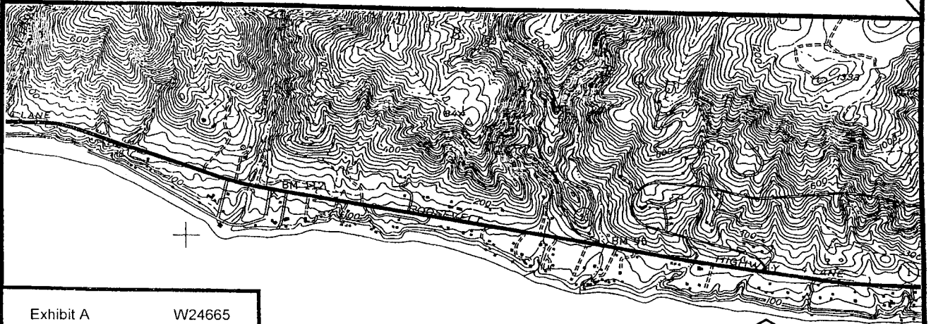
Exhibit A W24665 32606 Pacific Coast Highway