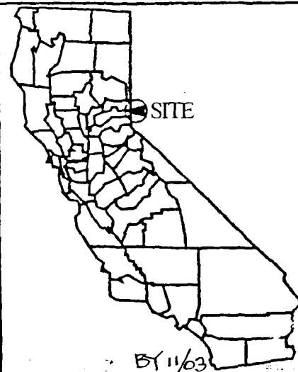
EXHIBIT A PRC 4916.9 Truckee-Donner Recreational and Park Dist. Donner Lake NEVADA COUNTY