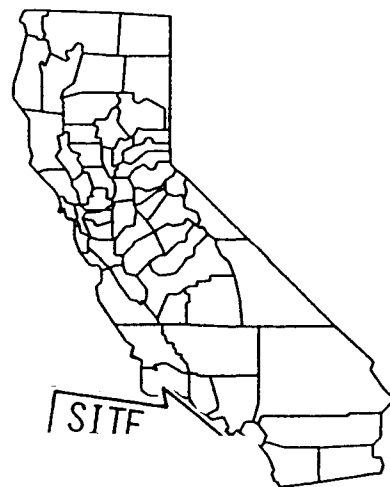
EXHIBIT A PRC 5258 LOCATION MAP TRINIDAD ISLAND HOA CITY OF HUNTINGTON BEACH ORANGE COUNTY, CALIFORNIA