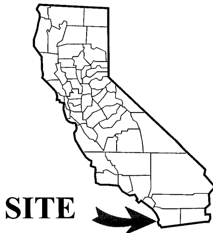
EXHIBIT A SHEET 1 OF 2 W20725.103 SAN DIEGUITO LAGOON OPENING