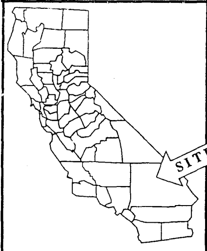
EXHIBIT B SITE MAP PRC 7527.2 ALL AMERICAN PIPELINE CO. RIGHT OF WAY SAN BERNARDINO COUNTY

This Exhibit is solely for purposes of generally defining the lease premises, and is not intended to be, nor shall it be construed as, a waiver or limitation of interest in the subject or any other property.