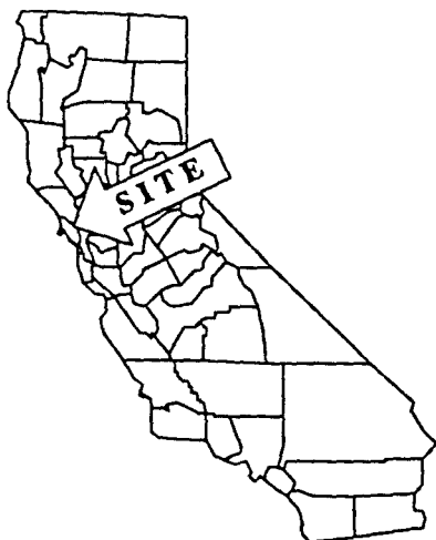
EXHIBIT "A" Site Map WP 5274 Petaluma River MARIN COUNTY

EXCEPTING THEREFROM any portion lying landward of the Ordinary High Water Mark of Petaluma River, as it last existed in a State of Nature.