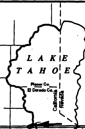
EXHIBIT "A" PRC 5576.9 APN 018 - 291 - 141 Lake Tahoe EL DORADO COUNTY

This Exhibit is solely for purposes of generally defining the lease premises, and is not intended to be, nor shall it be construed as, a waiver or limitation of any State interest in the subject or any other property.