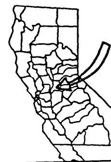
EXHIBIT "B" WO-25194