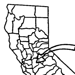
EXHIBIT B W 24696